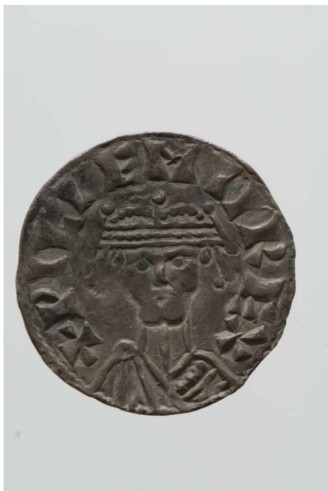
A Silver coin of William the Conqueror. It was struck at the Castle in York in 1068 and was then buried in the city around the time that William the Conqueror 'harried' the North in 1069.